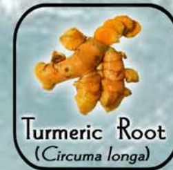
Turmeric Root ( Curcuma longa )

Turmeric Root acts as a natural anti-bacterial and anti-fungal agent. It has a soothing action on respiratory ailments such as coughs and asthma.