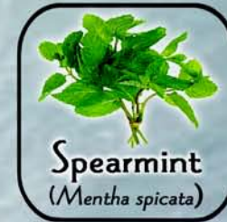
Spearmint ( Mentha spicata )

Turmeric Root acts as a natural anti-bacterial and anti-fungal agent. It has a soothing action on respiratory ailments such as coughs and asthma.